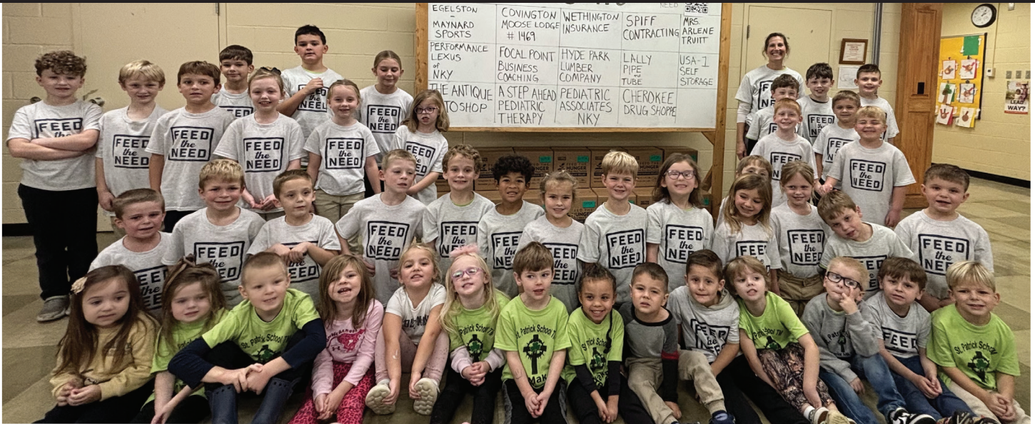
OUR SAINT PATRICK SCHOOL CHILDREN PACKED 5,000 MEALS FOR CHILDREN IN BANGLADESH IN PARTNERSHIP WITH FEED the NEED